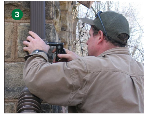
3 Attach a flexible extender or elbow.