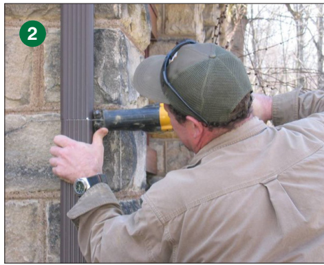
2 Cut off an existing downspout above the barrel.