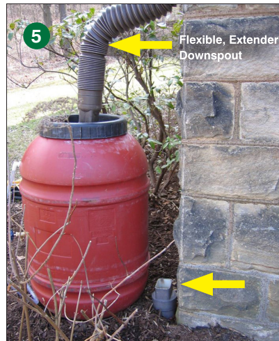
5 This set up allows the downspout to be re-attached, and the barrel stored in winter.