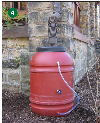
4 Direct the overflow hose to the landscape bed.