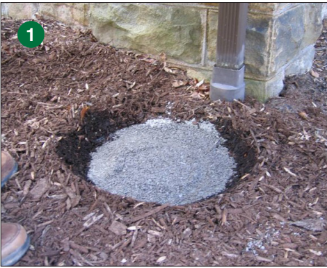
1 Prepare a solid base.