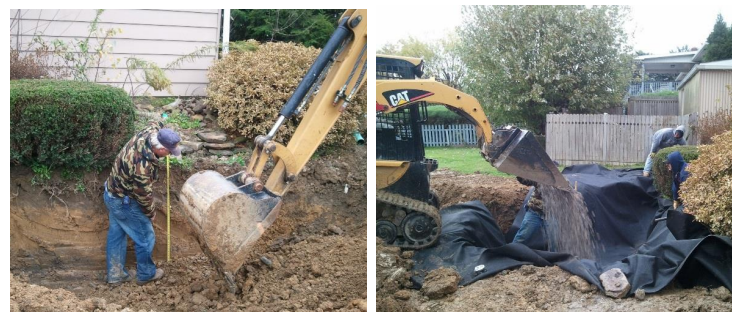
Digging and backfilling a dry well for a roof downspout.