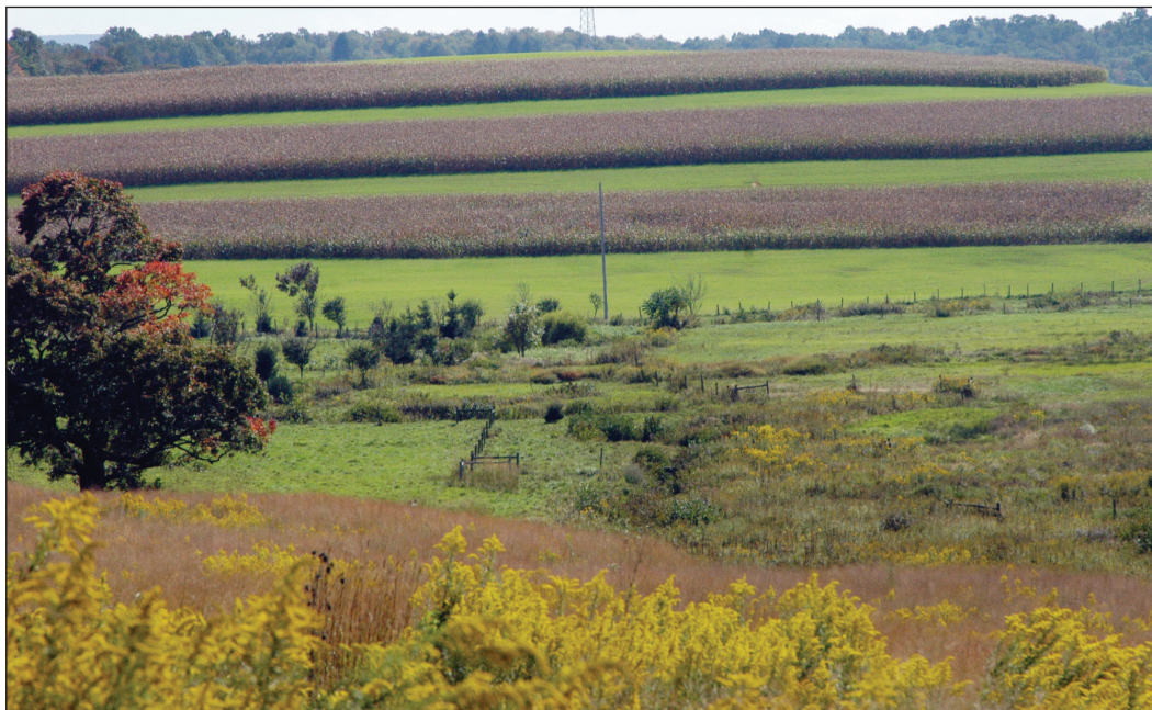
Contour strips and a stream buffer help control erosion on the Jess Stairs Farm in Mount Pleasant Township.