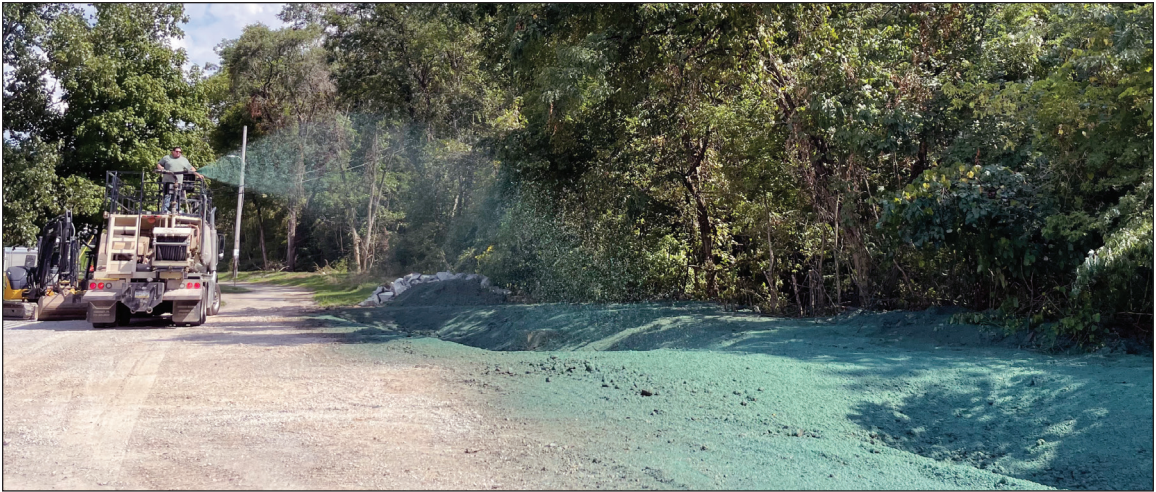
Hydroseed is sprayed on infiltration swales for final stabilization at Irwin Park.