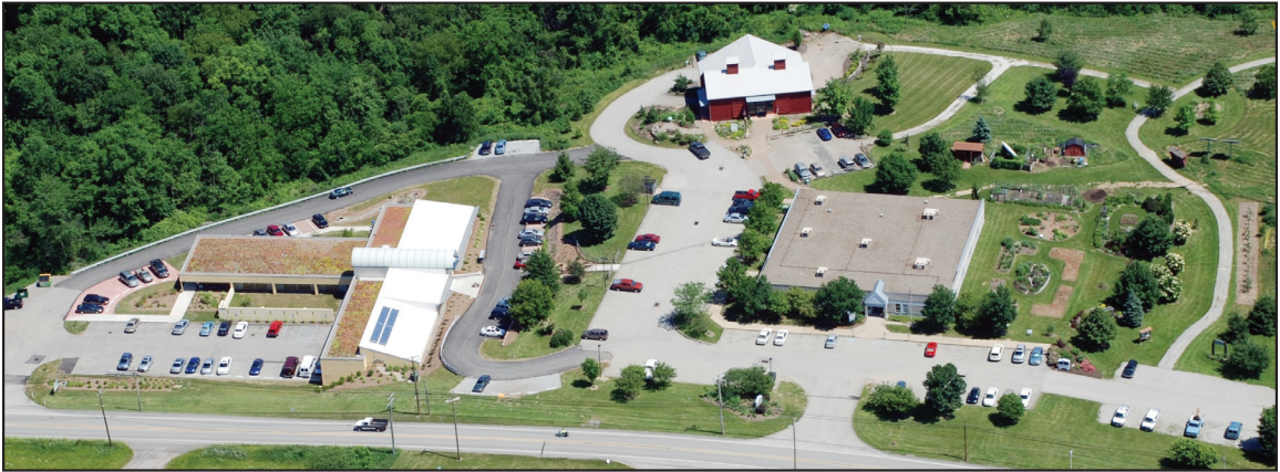
Donohoe Center Campus, Greensburg

Bureau of Conservation and Restoration ..... Page 30