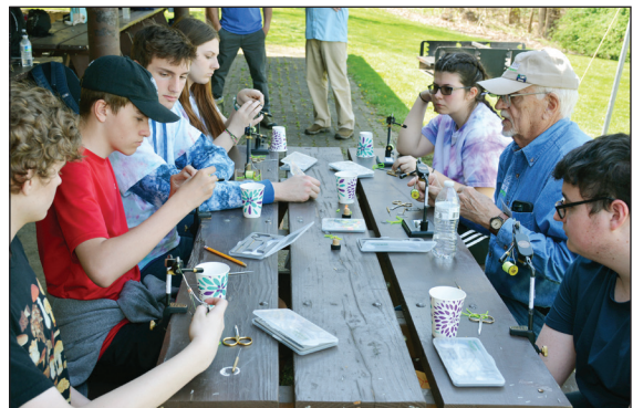
2023 Westmoreland County Envirothon teams learned the art of tying flies for trout fishing and fly rod casting from members of the Trout Unlimited Forbes Trail Chapter.