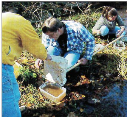
Volunteers sampling for macroinvertebrates on Little Pucketa Creek