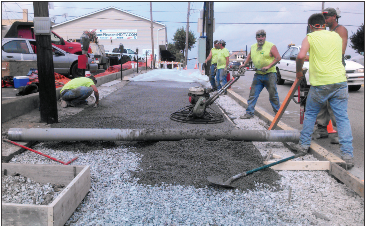
Contract workers install a porous concrete sidewalk over a stone and perforated pipe infiltration bed along Diamond Street in Mount Pleasant Borough, Jacobs Creek Watershed. Trees also were planted here and will be watered as rain and melting snow and ice infiltrate through the sidewalk.