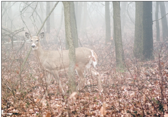
White Tailed Deer