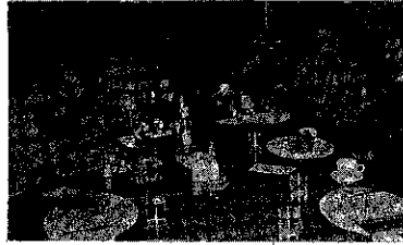
Pictured above are representatives of various agencies concerned with conservation work throughout Westmoreland County.

Bureau of Forestry Loyalhanna Watershed Association Soil Conservation Service Pennsylvania Fish Commission Pennsylvania Game Commission Division of Oil & Gas Bureau of Surface Mine Reclamation and the Westmoreland Conservation District