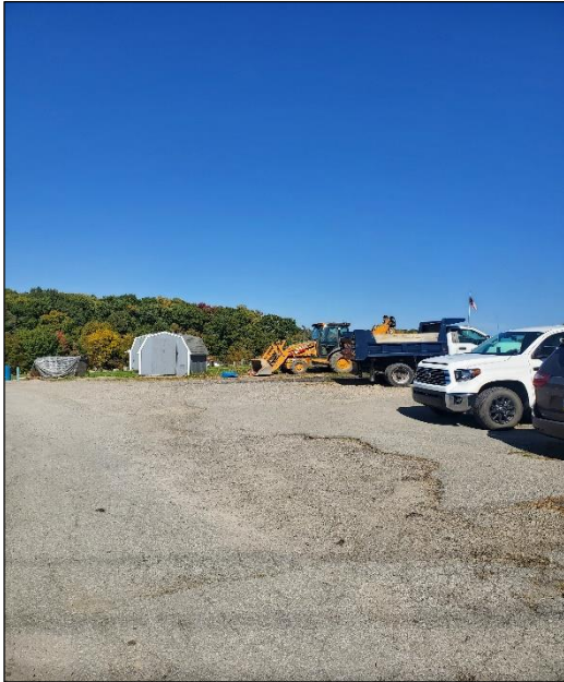
(Before) Derry Borough Municipal Water Authority Parking lot