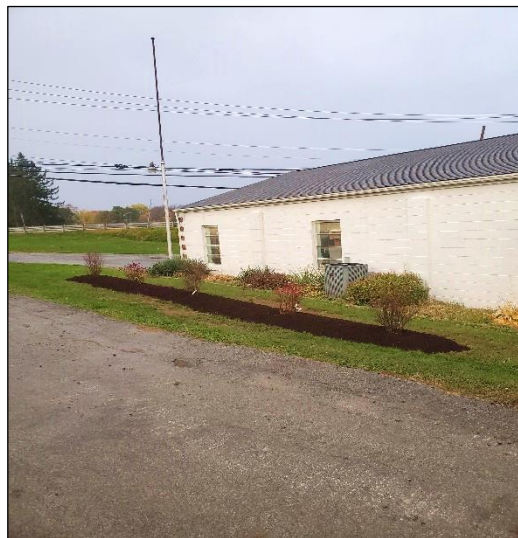
New shrubs planted