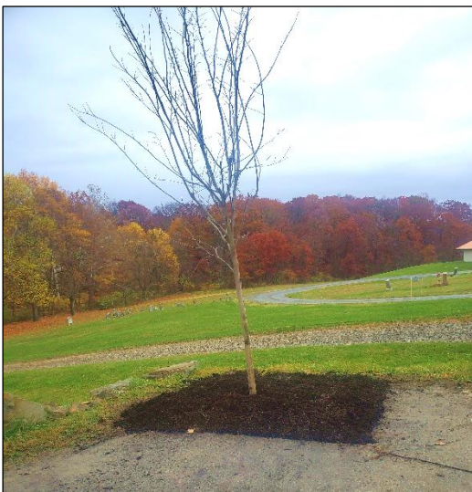
New tree planted