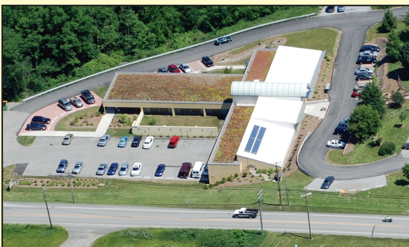
The GreenForge building renovations at Donohoe Center included the first green roof in Westmoreland County.

One of WCD's early projects made possible by the Foundation was for the expansion of WCD's campus - this involved acquiring an adjacent building and renovating it to make it a more sustainable, green building. In 2015, WCD received funding to develop a plan to manage local water resources; obtain