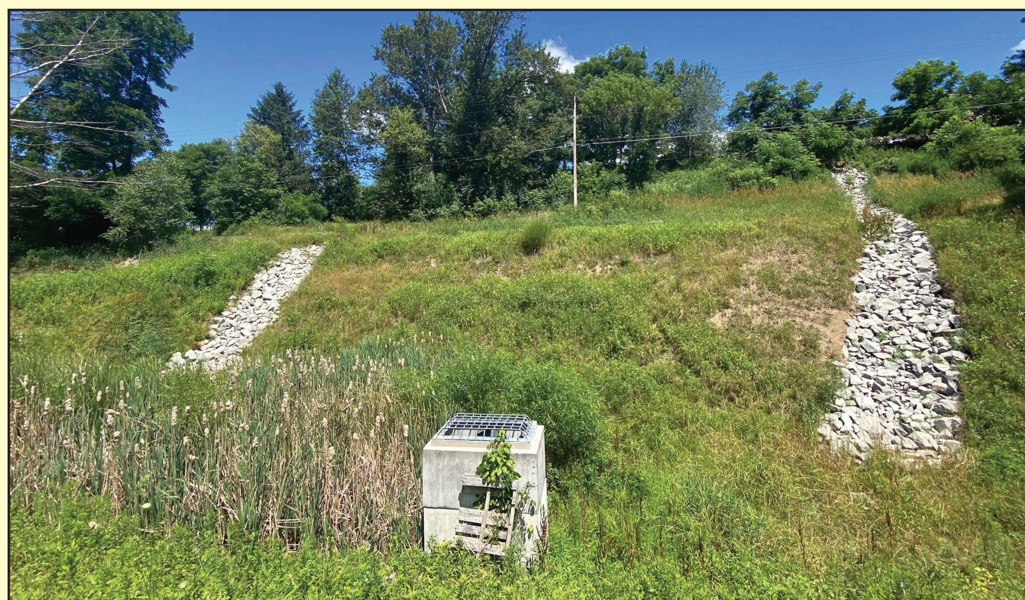
Stormwater basin retrofits at Ligonier Valley School District to allow more storage capacity.

in improved water quality and protection of the surrounding habitat;