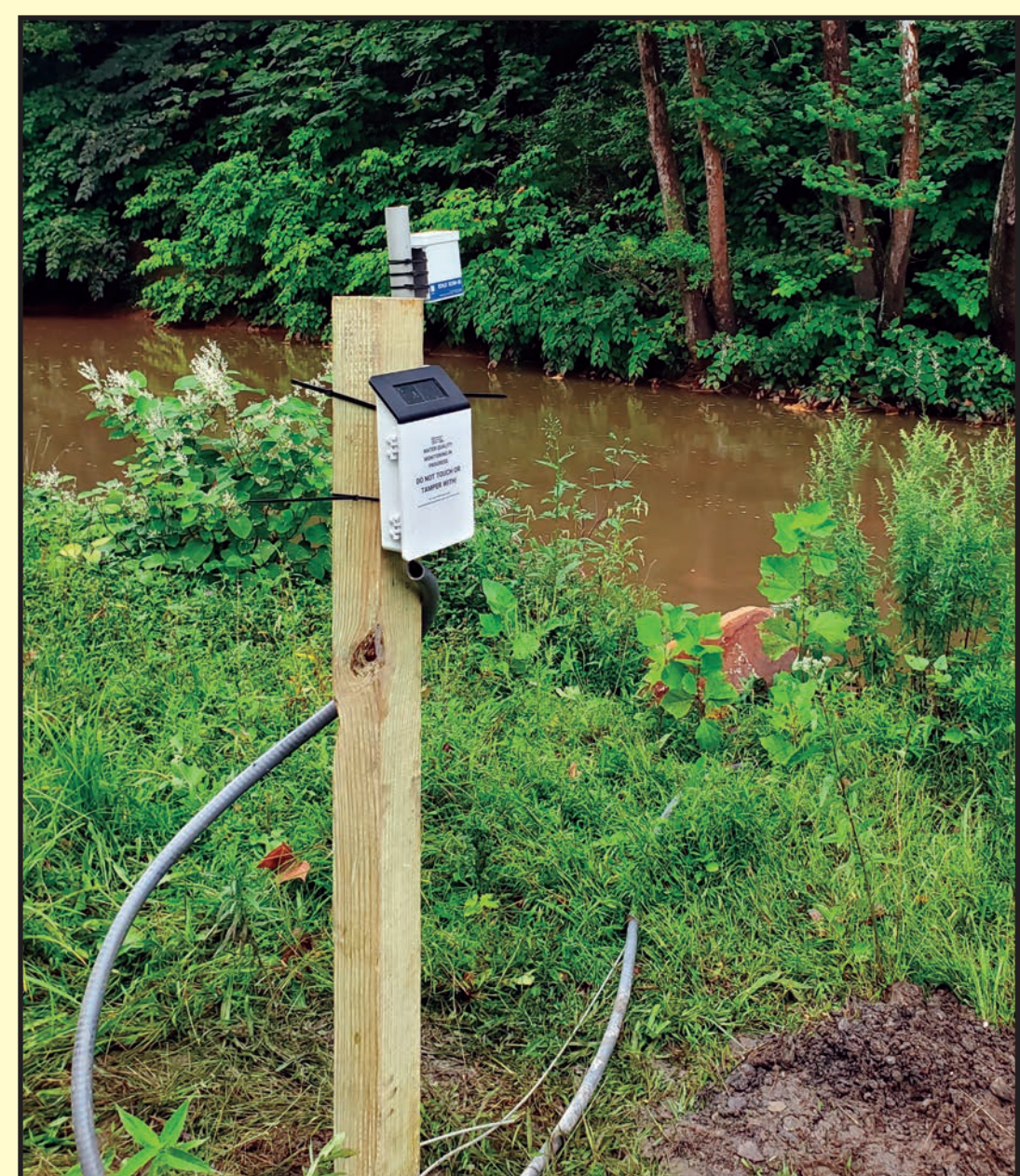
Monitoring Brush Creek in the Turtle Creek Watershed.

scientific data regarding stormwater management; and install a green parking lot at a church in Ligonier. In 2021, WCD was awarded funding to conduct a feasibility study on a potential revolving loan program to complete green infrastructure and stormwater management projects. Recent funding has enabled WCD to complete several Stewardship conservation projects throughout Westmoreland County, including: