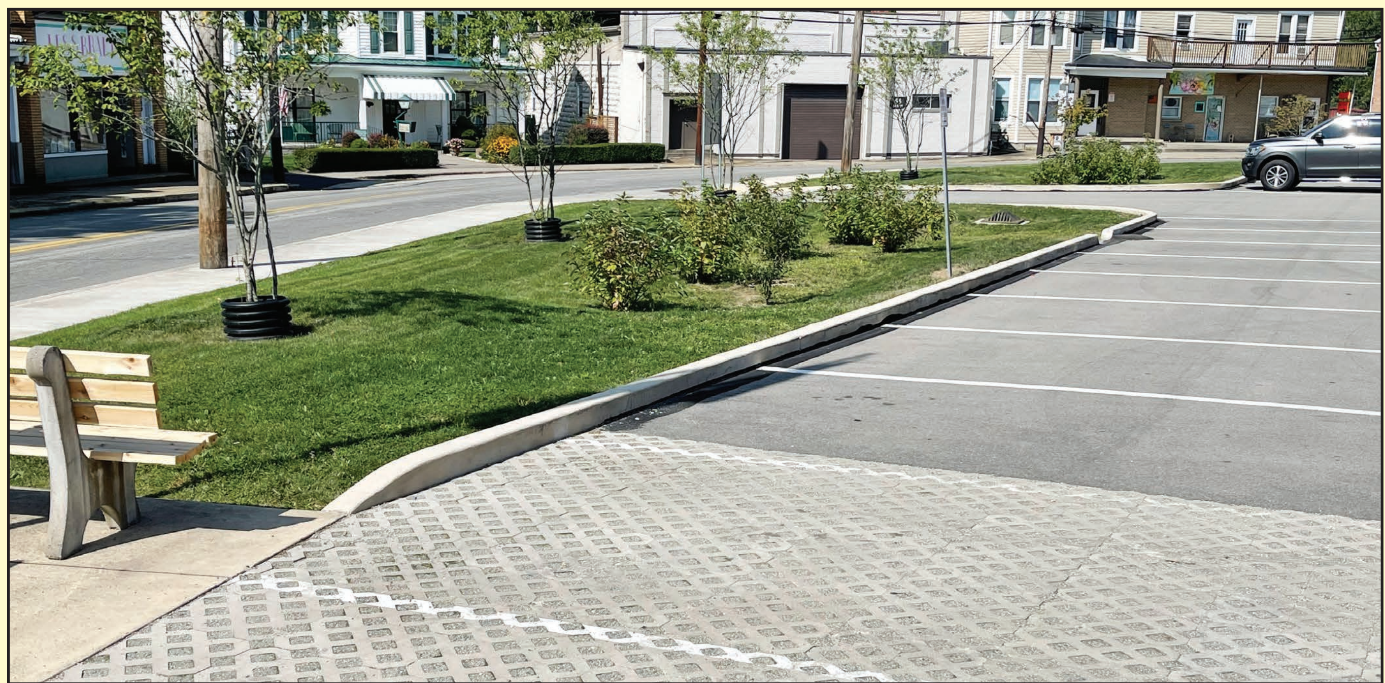
Permeable parking surfaces and rain gardens promote the infiltration of stormwater in Manor Borough improving water quality.