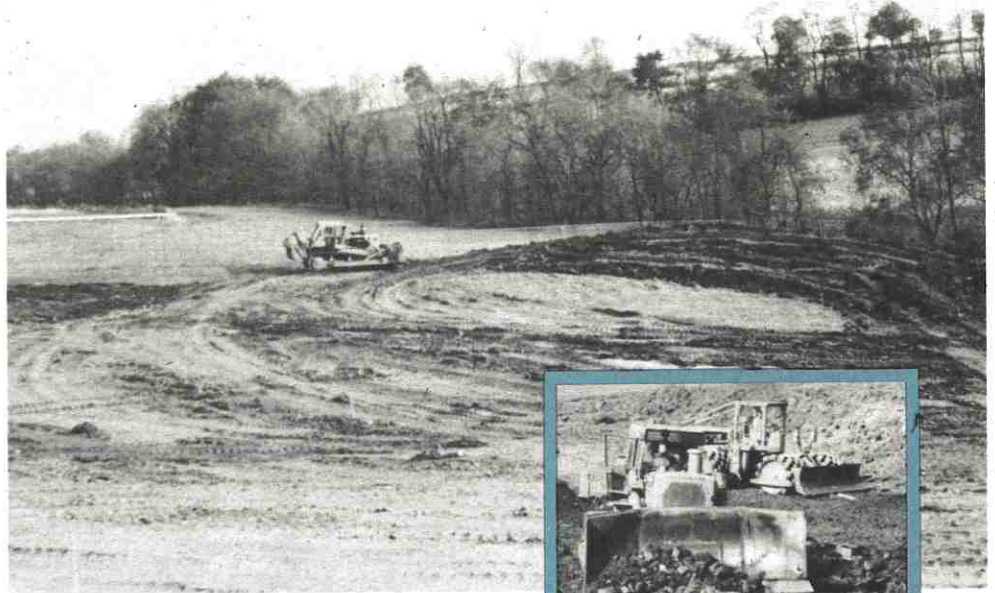
by J. Walter Pillsbury

One of the major attractions at the Westmoreland County Fair is getting a new home. The Fair Board is constructing a new arena for demolition derbies, tractor pulls, and other such events. The new arena is located just northeast of the existing one, and will be 560 feet long and 240 feet wide — over twice the size of the old arena.