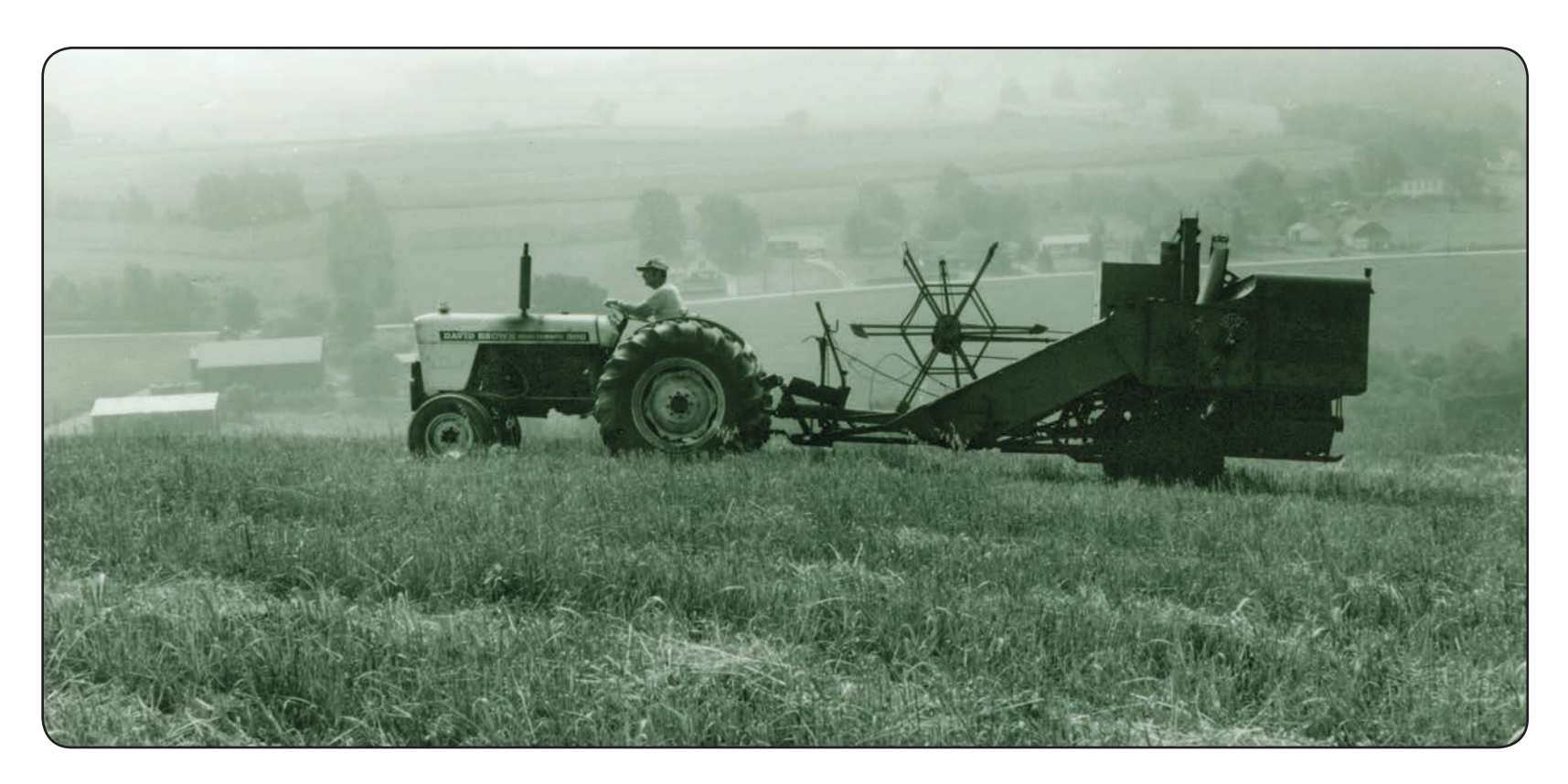
District is the first in the state to award a project under the new Landowner Reclamation Program, in which property owners can reclaim abandoned mine lands on their property.

District joins with the Allegheny County District to begin work on the region's first watershed-wide stormwater management plan, focusing on the Turtle Creek Watershed.