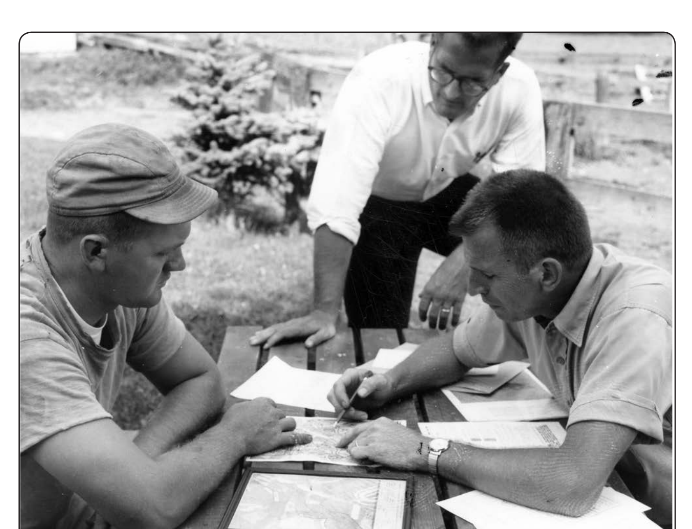
District issues its first formal strategic plan under the leadership of its volunteer board.

Westmoreland Conservation District founded.