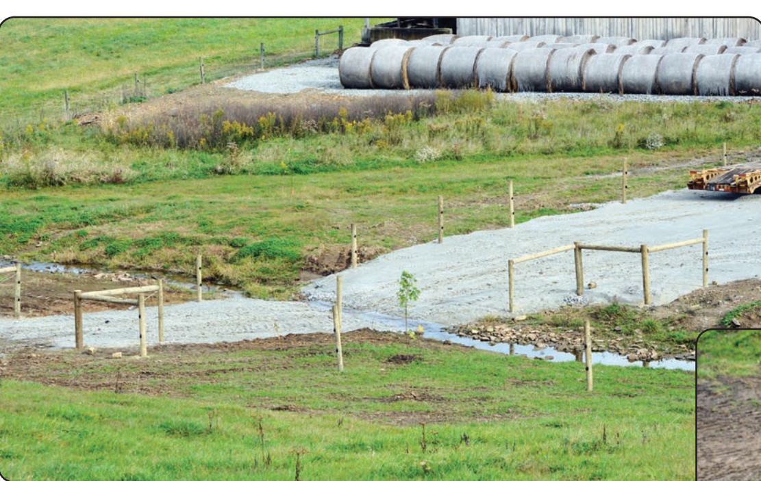
above: An animal stream crossing under construction; right: planting shrubs to help prevent erosion.

Many new faces have become part of the District Staff due to retirements, succession and opportunities.